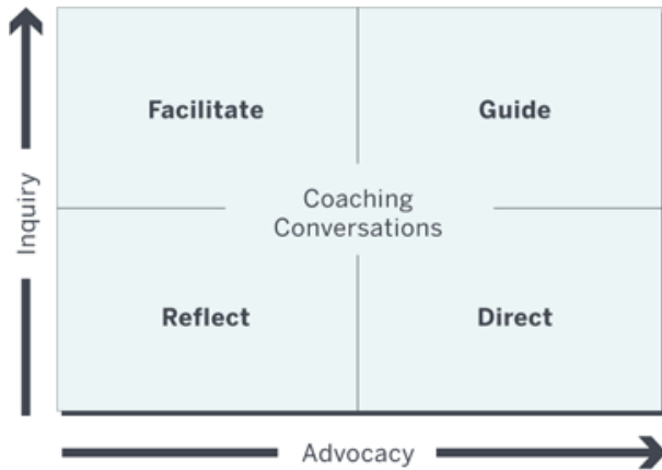
Figure 2. Inquiry and Advocacy model. © Interaction Associates, Inc.